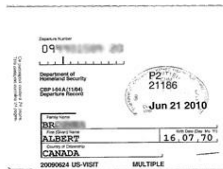
Example of an I-94 Departure Record

The costs of a P2 extension are the same as the costs of a new P2.